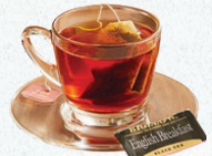
English Breakfast 89.000