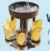
Wasabi 1 shot: 189.000 combo 6: 999.000