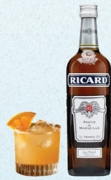
Ricard & Orange Juice 269.000 2.148.000