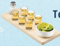
Tequila 1 shot: 189.000 combo 6: 999.000