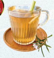
Honey Ginger "Lemon grass, Honey, Ginger" 99.000