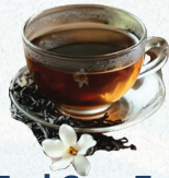
Earl Grey Tea 89.000