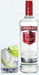
Smirnoff & Mix 252.000 2.056.000