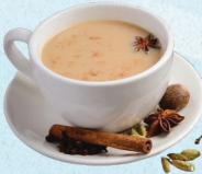
Masala Chai 59.000