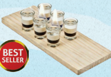
B52 1 shot: 219.000 combo 6: 1.199.000