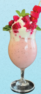
Dragon fruit 99.000