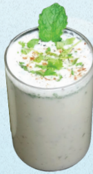
Masala Chaas 79.000