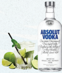
Absolut & Mix 266.000 2.155.000