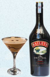
Baileys & VN coffee 252.000 2.056.000