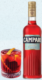
Campari & Orange Juice 248.000 1.990.000