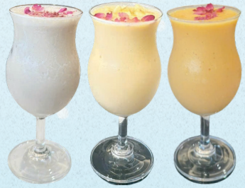
Thandai (Classic or Banana or Mango) 99.000