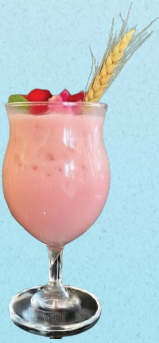
Viet's flavor Pomegranate, greenrice flakes 119.000