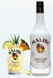
Malibu & Pineapple juice 245.000 1.980.000